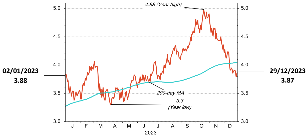
US 10-year government bond yield

Readers frequently inquire about the accuracy of our predictions and whether we track them. Naturally, we don't possess a crystal ball, and the primary objective of our analyses is to present our readers with the most probable scenarios in the medium term. However, we do provide specific exchange rate predictions and in general they have been quite accurate. Below are our forecasts for US and German 10-year government bonds for the period from January to December 2023.